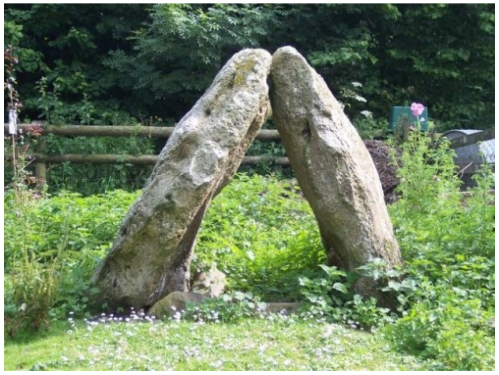
Egbert's stone. Now in the village of Kingston Deverill. Wiltshire.

emerged from the forest. Wessex had a new army and that new army had a King.