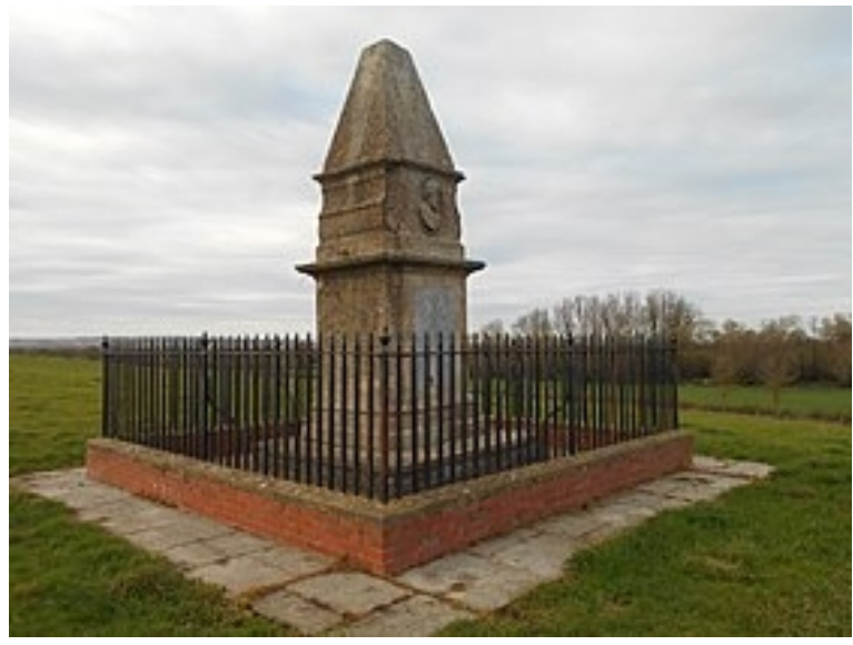
Alfred's monument at Athelney.

Over the course of the next few years Alfred mounted raids on the Vikings from Athelney but he knew that his warband was too small to face the them in open battle. He prepared a plan. He intended to re-take his Kingdom and he was going to defeat Guthrum.