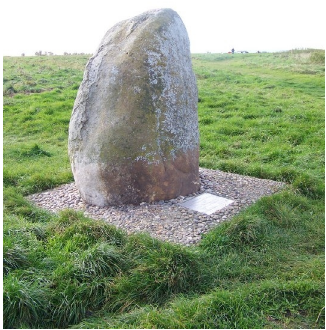
Modern monument to the battle of Edington at Bratton Castle.

The Saxons were on their tails for the whole retreat. It was some 12 miles back to the fortress and the terrified Vikings were cut down as they fled. Many of the English were mounted and though not used to fight in the style associated with traditional cavalry, their mobility made them highly effective and fleeing men on foot are easily cut down by horsemen.