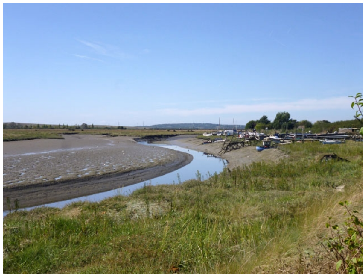
BENFLEET CREEK. THE AREA WHERE THE VIKINGS BEACHED THEIR SHIPS. This file is licensed under the Creative Commons Attribution-Share Alike 2.0 Generic license. Attribution: Benfleet Creek by Robin Webster

In the 19<sup>th</sup> century, workmen building a railway through the remains of the Viking camp discovered the remains of the burnt ships. Unfortunately, they were destroyed during the construction and nothing now remains of them.