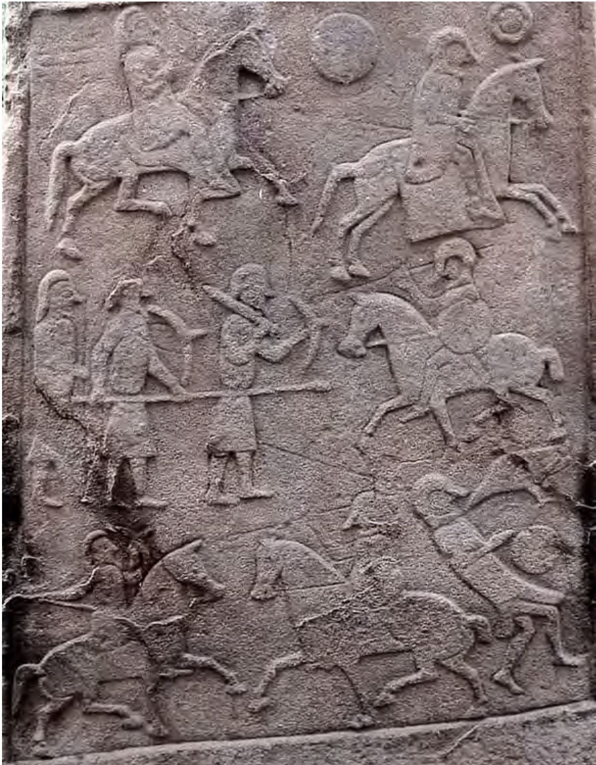
Picts fighting Northumbrian cavalry on one of the Aberlemno Stones.